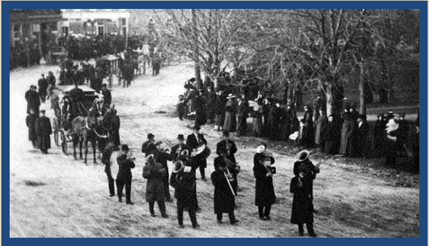
Funeral procession on Goderich Square for un-named sailors after the Great Storm 1913.

Maitland Cemetery: "SAILORS" Memorial – Gathering at the unknown sailors tombstone.