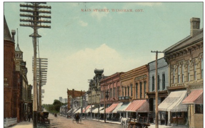
Main Street Wingham