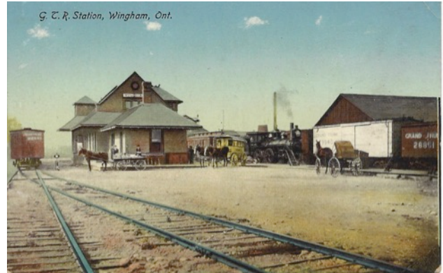
GTR Train Station, Wingham