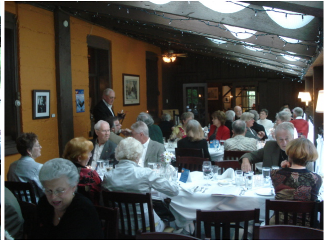
Benmiller Inn hosted the event on an evening when it offers a Seniors Dinner option at an affordable price. Here is part of the group gathered for dinner in the Sun Room off the main dining room.