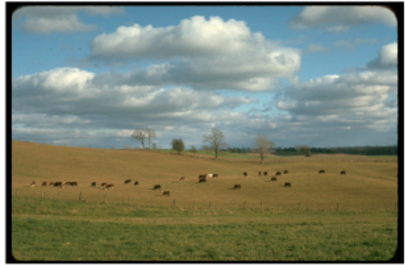
Feeder cattle grazing hillsides of Colborne Township, 1968