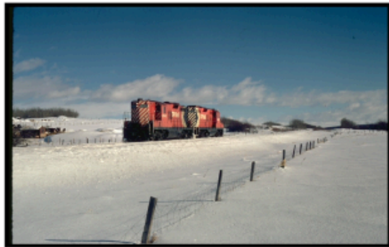
CPR engines on the Guelph to Goderich line in 1967