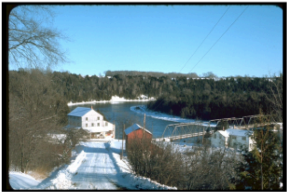
Pfrimmer's grist mill on the Maitland River at Benmiller, 1967