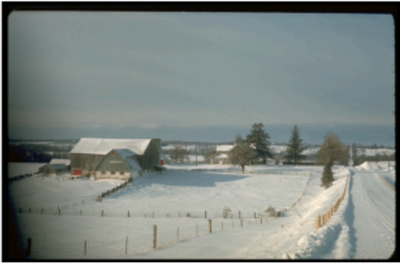
Hardy farm, Colborne township, 1 km from McGaw, 1967