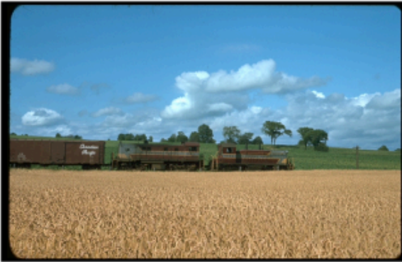
CPR engines pulling train past wheat field near Shapit, 1967